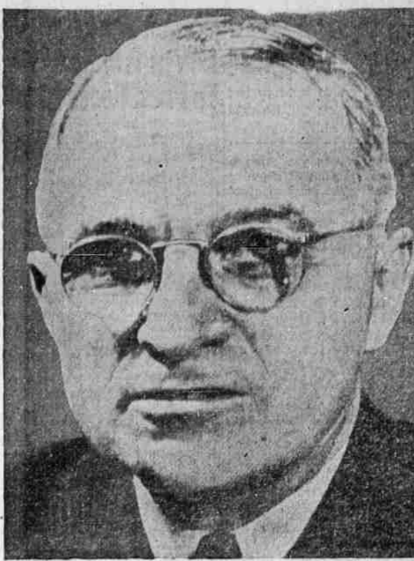
Harry S. Truman Former Missouri farm boy, sworn in as 32nd president of the United States.