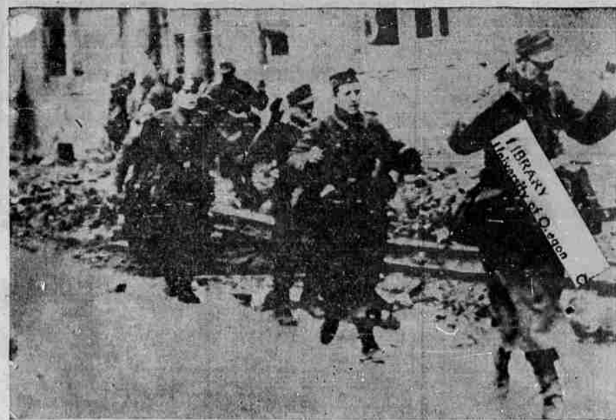
COBLENZ MOP UP—German fighting men, routed out of their stronghold in a Coblenz building, march off to prisoner of war camps as American Third army troops enter the building to search for snipers still firing from concealed positions. Signal corps radio-telephoto.