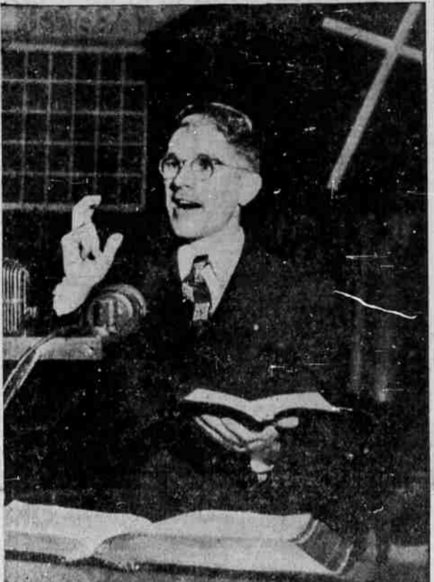
DODDS READY FOR GOSPEL TOUR —Gil Dodds, star runner who hung up his spiked shoes in Boston to participate in a gospel preaching tour, brushes up on his oratory at Los Angeles Bible institute. "I learned how to run fast by keeping away from the Devil," Dodds smiled when asked how he gained such speed.

For hundreds, possibly thousands of years Solomon has been called "the wisest man that ever lived." If knowledge is power, then knowing how to use knowledge is even greater than knowledge itself. Archimedes claimed that with a lever and a fulcrum he could move the world. Jesus Christ, with a cross on a skull-shaped hill, did move it. Watt discovered and applied the explosive power of steam and set hundreds of wheels humming. Christ discovered and applied the explosive power of a new affection, and set millions of human hearts singing. Edison took inert material, charged it with energy and dispelled darkness with radiant light. Christ takes inert lives, changes them with His love and makes them shine above the brightness of the firmament." Solomon died about three thousand years ago and is now but a name. Christ, greater than Solomon is still here though He died on a cross nearly two thousand years ago. "I know not where the way may lead, Or if the skies be blue or dim; My hungry soul I know He'll feed And guide my weary soul to Him." Amen.