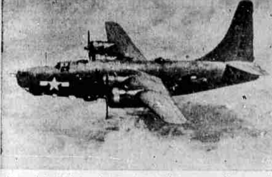
Above is first photo released of the Privateer, new Navy search plane officially tagged the PB4Y-2. Able to range over 1500 miles from base, unescorted, and return, it can attack the enemy as well as defend itself. It carries a dozen 50-cal. guns in six turrets, can stay aloft 20 hours and has a top speed of over 250 mph.