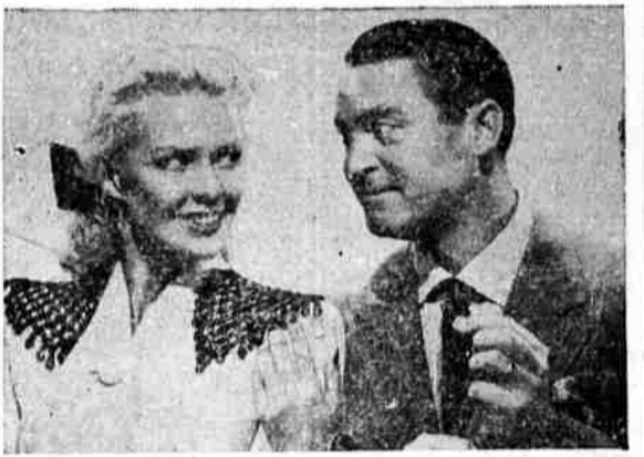
Janis Carter with Chester Morris, as Boston Blackie, in "One Mysterious Night," the latest of the series of mystery thrillers.