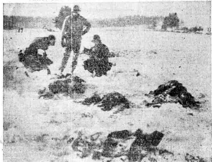
Tight-lipped furious Yanks check identification of these bodies of American soldiers, killed by their Nazi captors in cold blood after they had been captured. Before Germans turned their machine guns on the defenseless men, they first stripped them of their cigarettes and all valuable possessions. Only a handful of the men left to die in the Belgian snow escaped to tell the fiendish story.