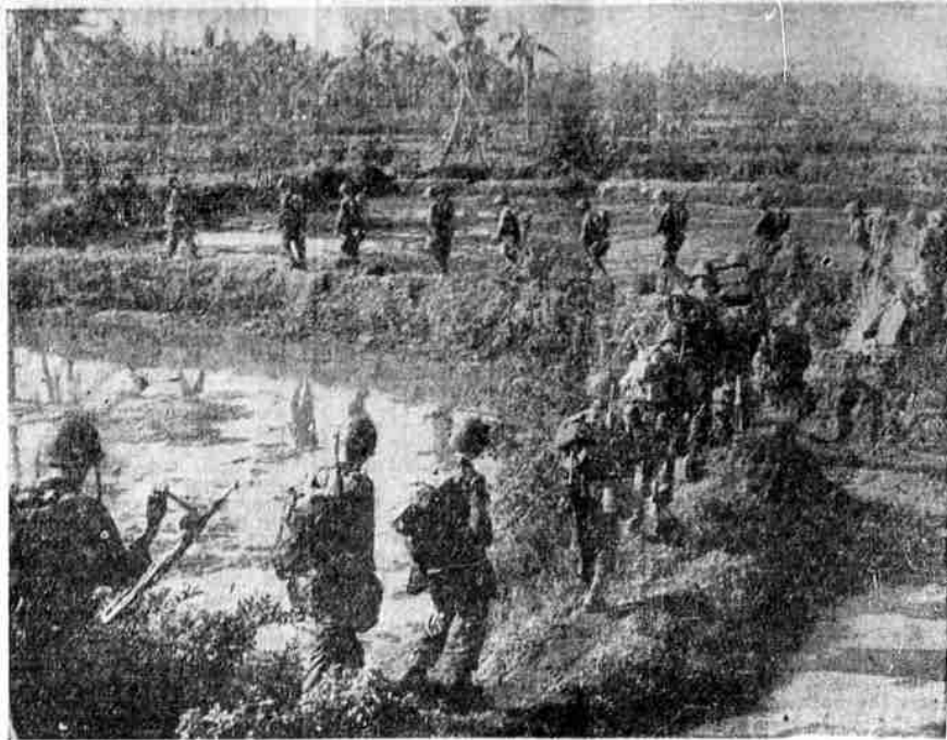
Pushing forward single file through rice fields, these American infantrymen advance from beachheads near Binmaley, Luzon, as they pursue Nips in face of light opposition.