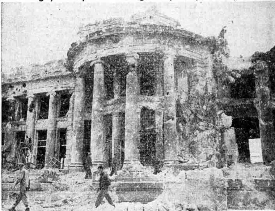
This is all that remains of Lingayen, Luzon, Capitol Building, completely destroyed by American pre-inauguration naval bombardment because defending Japs were using the modern stone building as a fortress.