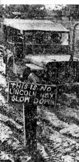
Read outside an Ordnance Depot in France shows the kind of heavy going American troops have had to face. War Bonds pay for necessary motor equipment. Buy War Bonds. U. S. Treasury Department

Wednesday—7:30-9:30, adult badminton, Junior high gym. Wednesday—7:30-9:30, high school boys ping pong, room 212 Junior high. Thursday—5:15-6:30, men and boys volleyball, Junior high gym. Thursday—7:00-9:00, Christian church boys basketball, Junior high gym. Friday—7:00-9:00, girls' wood-