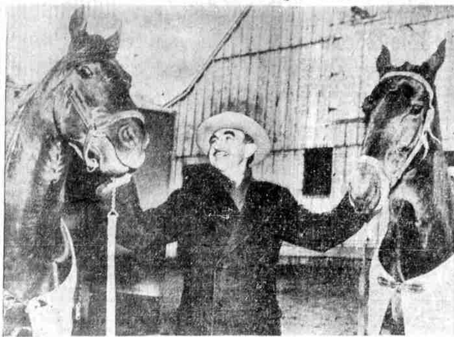
Senator-elect Wayne Morse of Oregon, former WLB member, pats his saddle horses, "Spice of Life" and "Oregonna Bourbon," after arrival in Washington, D. C. delayed by ice, sleet and snow and lack of gas. Horses rode in trailer but Morse claimed he feared he might have to hitch them to his car to continue his journey cross-country.