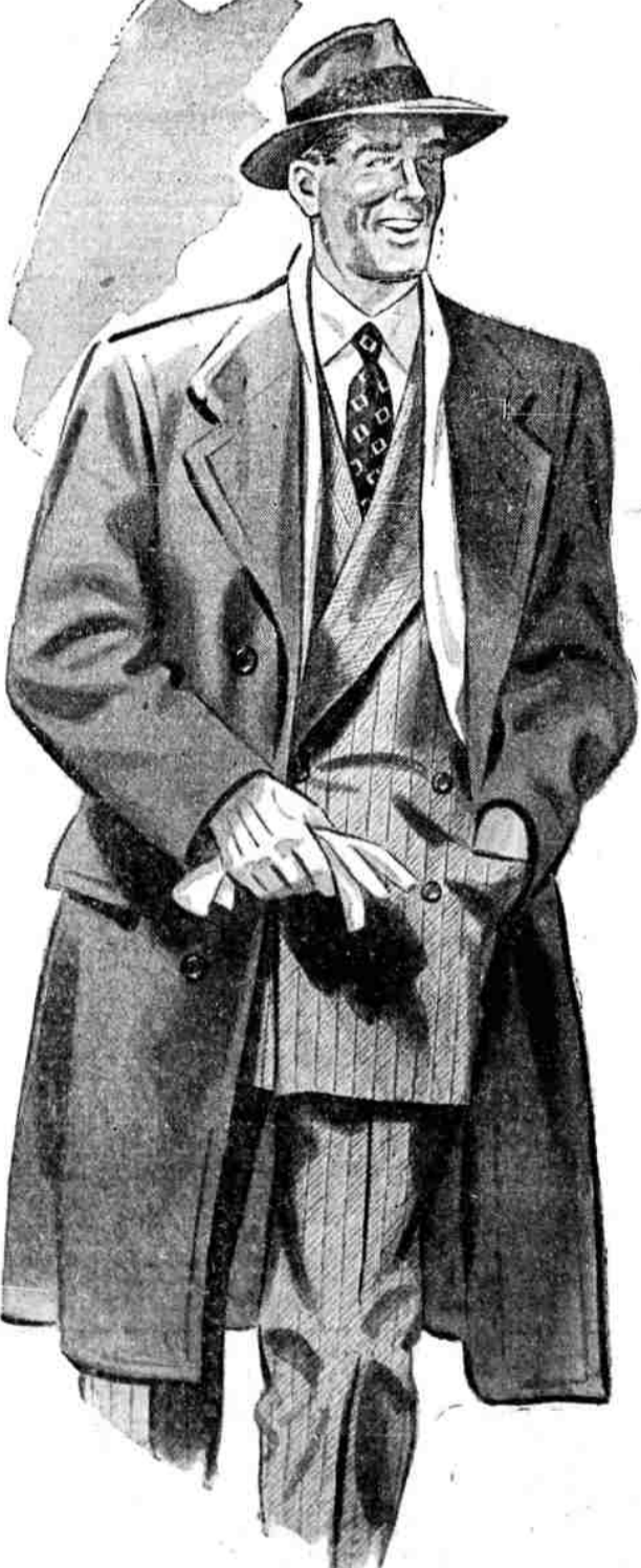
S&H Green Stamps, all depts.

Drop in today and on short order we'll have you outfitted completely for the cold weather ahead.