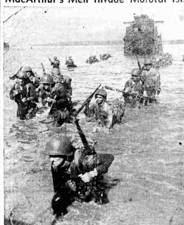
With "necklaces" of hand grenades and rifles, these Yank intantrymen of Gen. Douglas MacArthur's forces, swarm ashere in neck-deep water from their LCI's to Morotai Island beach, just south of the Philippines.