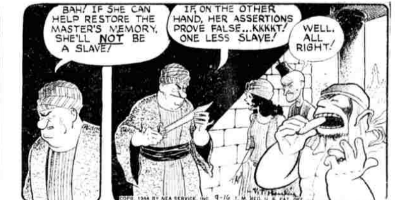
That Got Her