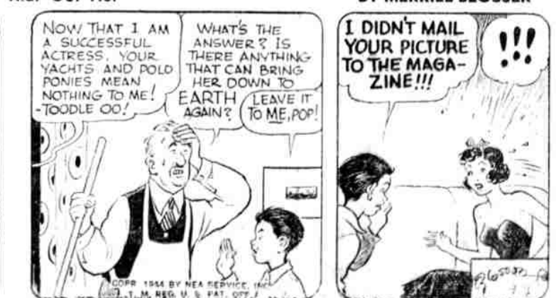
BY MERRILL BLOSSER