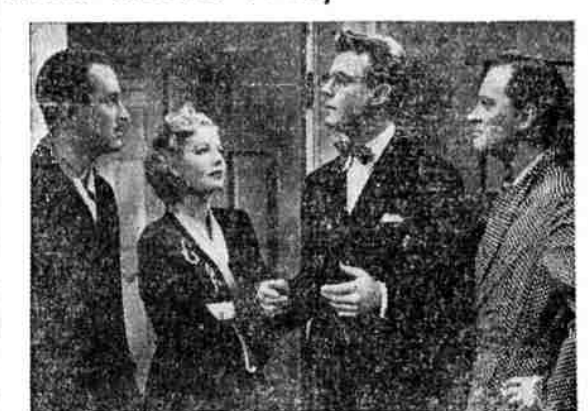
Lee Bowman, Marjorie Reynolds, Dennis O'Keefe and John Hubbard in a comical scene from their latest picture, "Up in Mabel's Room"