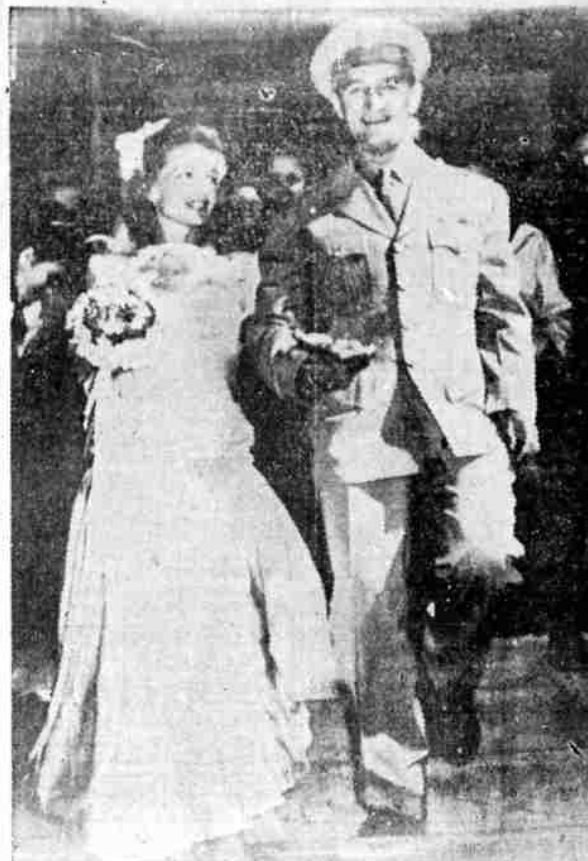
Leut. Tom Harmon and his bride, actress Elyse Knox, leave St. Mary's Chapel on University of Michigan campus, Ann Arbor, after wedding ceremony in the college town of his fiancée's triumphs. His wedding dress is made from nylon of parachute that saved his life in China.