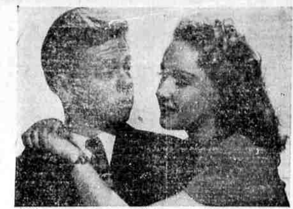
Mickey Rooney and Bonita Granville in a scene from MGM's latest picture, "Andy Hardy's Blonde Trouble," with Lewis Stone and Herbert Marshall.