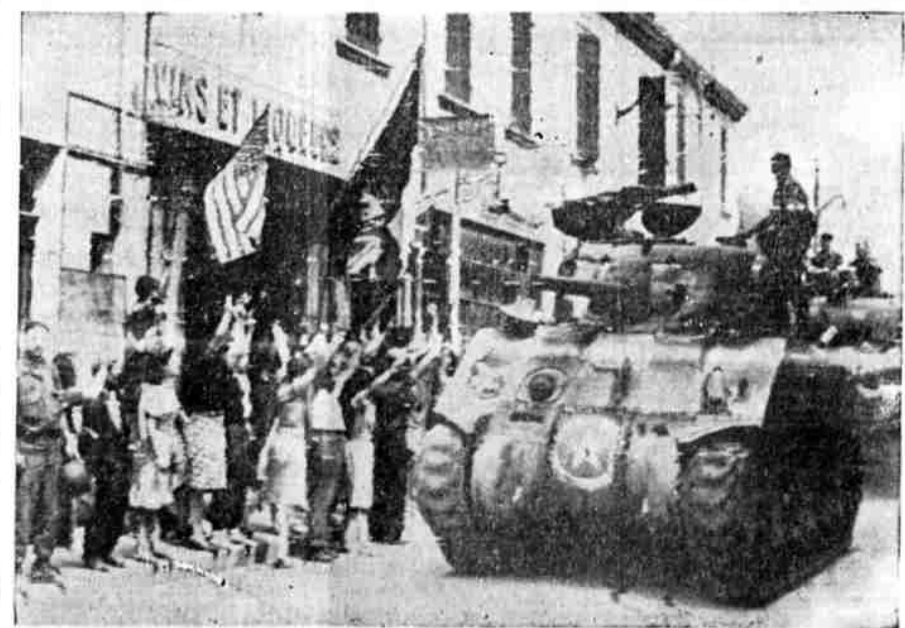
LIBERATED FRENCH CHEER YANKS—Cheering French civilians, holding up their hands in a V sign and displaying French and American flags, greet American tankmen passing through their liberated southern France village toward Toulon, giant French naval base. Signal corps radio-telephoto from Italy.

By L. F. Rosenstock Representatives of U. S., Britain and Russia (China participating later) today began the task of drafting a program for lasting world peace. Skeptics—and they are a legion—will wonder if they leave "la" in lasting.