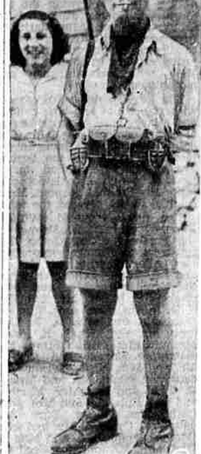
This Italian boy is not just "playing soldier" as his age might suggest. He's a full-fledged partisan, with real fire and grenades, who directed American troops away from areas in and around Livorno which he knew to be sown with Nazi land mines.

much because lamb and mutton account for less than 5 per cent of our total meat supply.