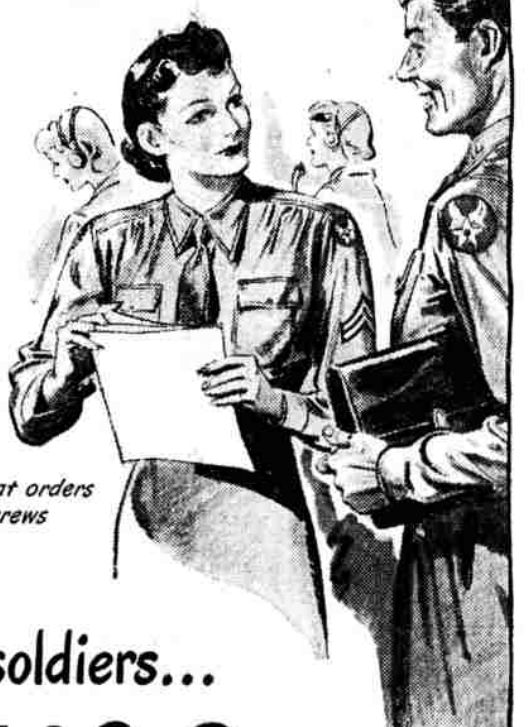
Sending combat orders to bomber crews

And the General says, "I wish we had a million more Wacs!"