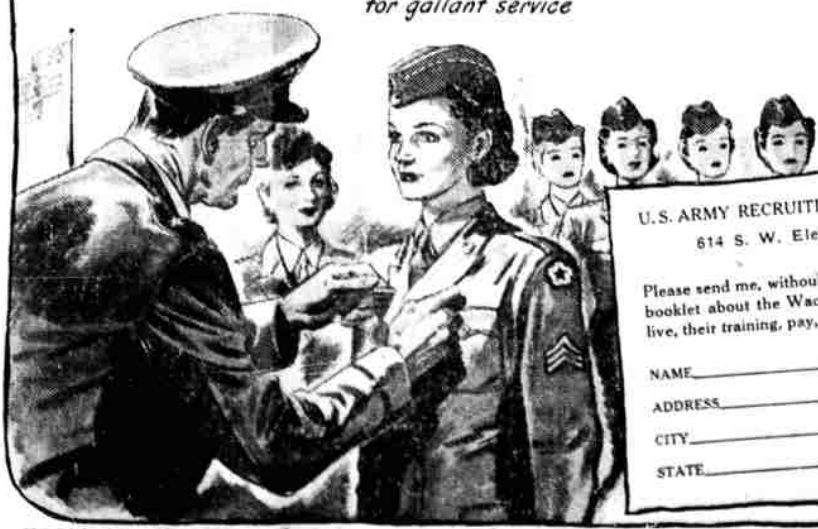
Winning recognition for gallant service

FOR FULL INFORMATION about the Women's Army Corps, go to your nearest U.S. Army Recruiting Station. Or mail the coupon below.