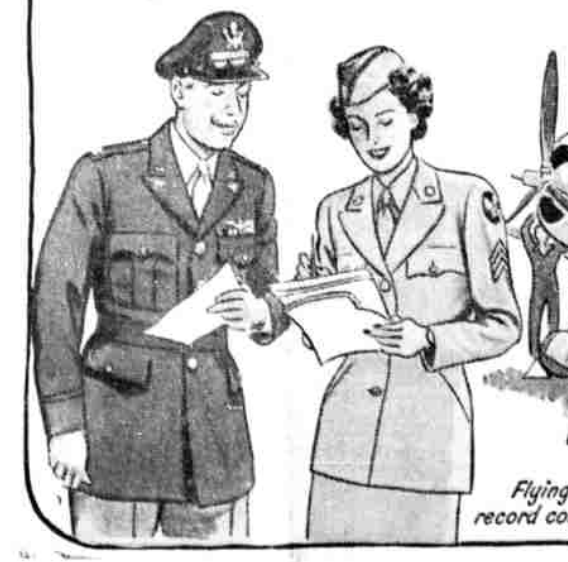
Flying secretaries record combat formation