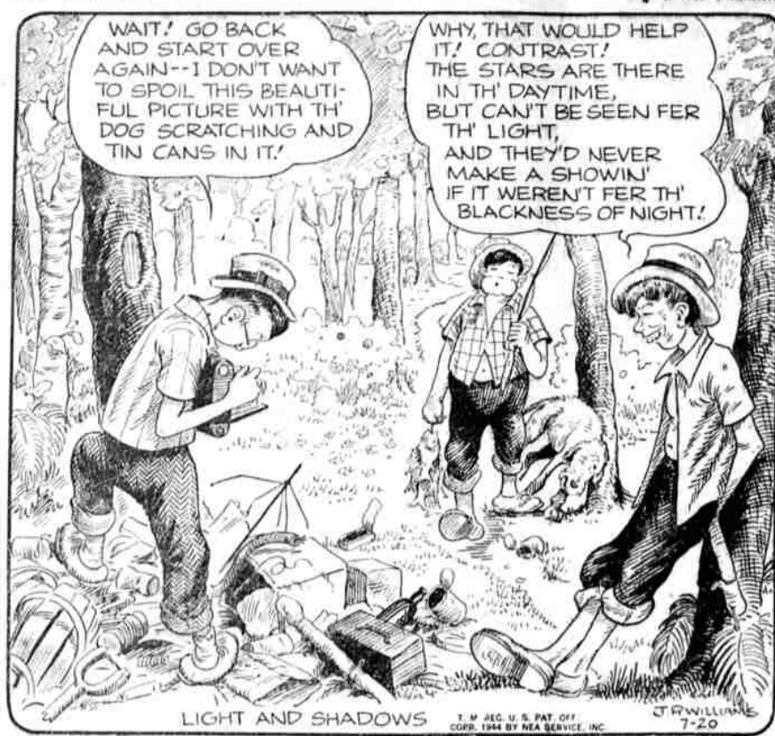
LIGHT AND SHADOWS T.M. REG. U.S. PAT. OFF. COPY, 1944 BY NEA SERVICE INC. J.R. WILLIAMS 7-20