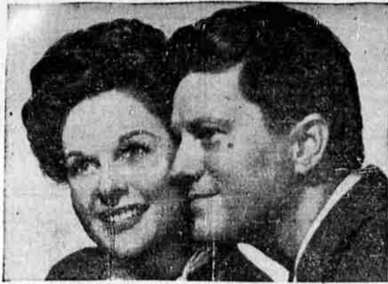
Susan Hayward and Michael O'Shea are co-stars in Samuel Bronston's production, "Jack London," with Osa Massen and Harry Davenport.