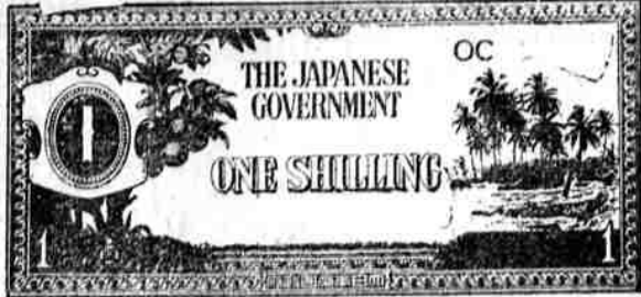
The Jap shilling note reproduced above is item of "invasion money" printed in Tokyo and intended for use in Australia after Japs took over that continent. American forces which occupied Hollandia found five tons of it in varying denominations.