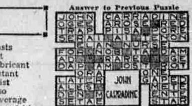
Answer to Previous Puzzle