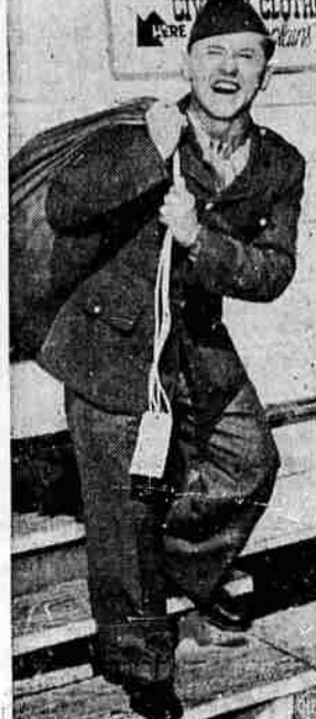
Flashing the old Andy Hardy smile, Pvt. Mickey Kooney, who is now in the Army, is pictured leaving quartermaster's depot at Fort MacArthur, San Pedro, Calif., after receiving his first U. S. outfit.