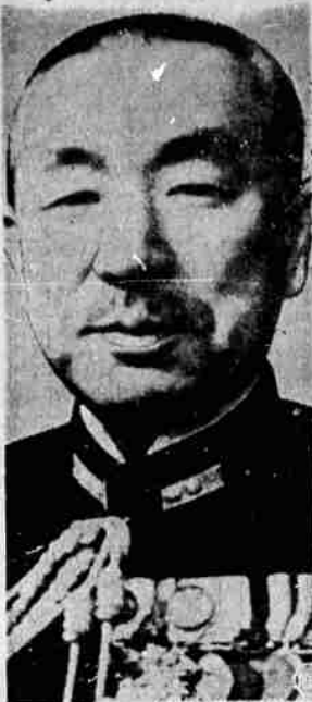
Admiral Mimitchi Koga, 58, commander-in-chief of Japanese fleet killed in action while directing general operations aboard an airplane. His death followed by 11 months that of his predecessor, Admiral Yamamoto, who planned and executed Japan's sneak attack on Pearl Harbor.