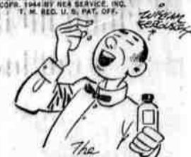
NEXT: Where they can down antelopes.