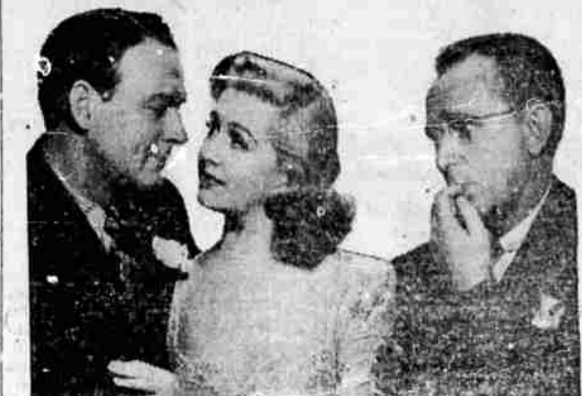
William Gargan, Marilyn Maxwell and Kay Kyser are shown in a scene from their latest and funniest musical, "Swing Fever," with Lena Horne.