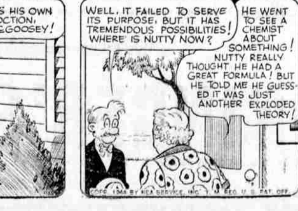
FRECKLES AND HIS FRIENDS Ask Pop, He Knows BY MERRILL BLOSSER