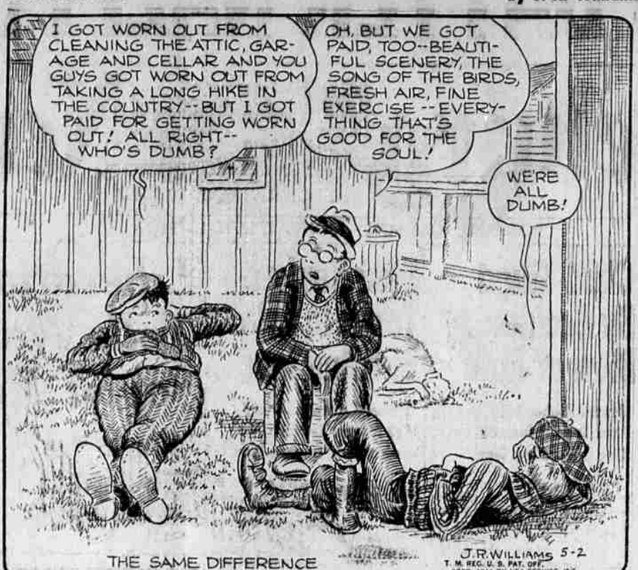
THE SAME DIFFERENCE

KRRR Mutual Broadcasting System, 1490 Kilocycles.