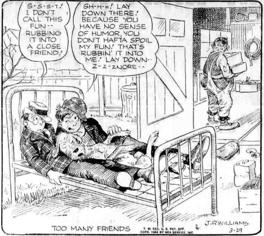
TOO MANY FRIENDS