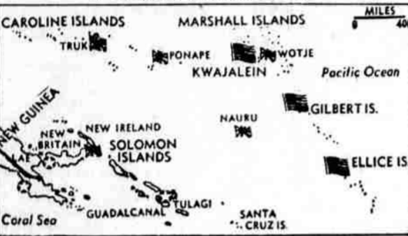
General MacArthur's forces drive with new fury in New Britain and Solomon Islands area in action closely co-ordinated with landings in Marshall. The enemy has been engaged along entire 5000-mile outer Pacific line as part of single over-all American strategy.