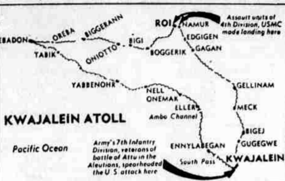
U. S. Marines and Army troops, 30,000 strong, have seized 10 islet beach-heads in the Marshalls and begun major assaults on main strongholds of Kwajalein, Roi and Namur Islands.