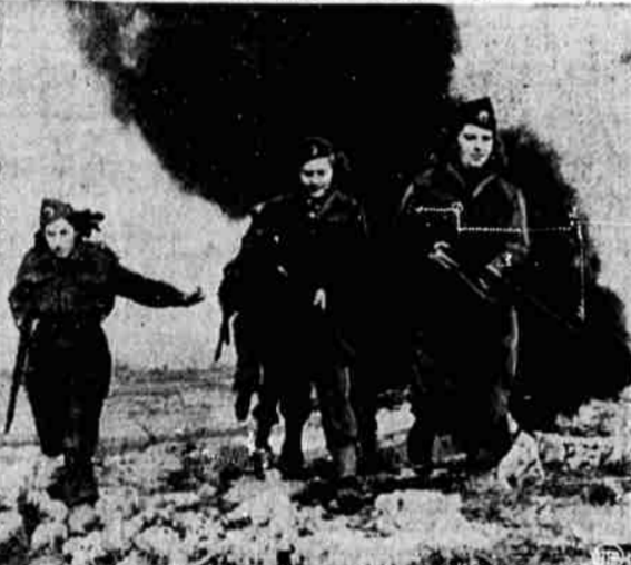
Recovered from wounds received while fighting with General Tito's Partisan forces, the Yugoslav girls above are pictured undergoing realistic battle practice, preparatory to return to fighting front. They train at Allied base in Bari area of Italy.