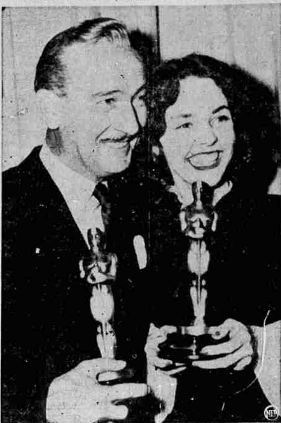
Jennifer Jones, 21-year-old actress who skyrocketed to stardom in her first picture, and veteran actor, Paul Lukas, proudly hold their coveted "Oscars," awarded them by Academy of Motion Picture Arts and Sciences for turning in best screen performances of 1943.