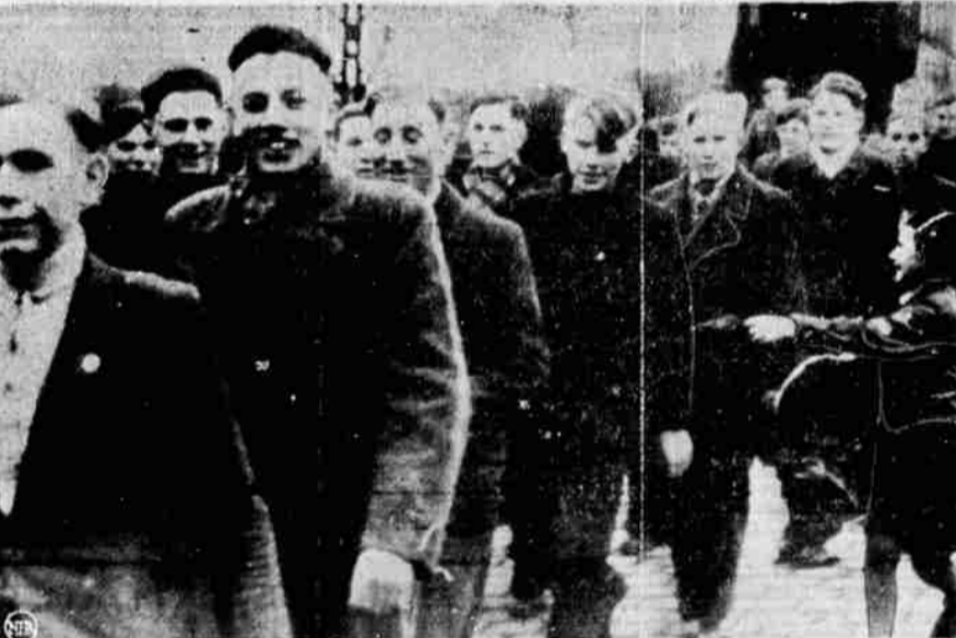
Waving goodbye to her brother, who is only a few years older than herself, a little German girl witnesses parade of the "Grossdeutschland" Infantry division composed of volunteers, some obviously no older than 13 years. This picture was radioed from Stockholm.