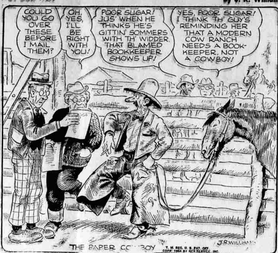
THE PAPER COWBOY