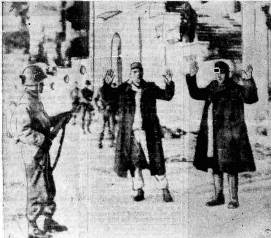
These two surprised-looking Germans surrender to Fifth Army soldier after Allied troops made landing in coastal town of Anzio, some 30 miles from Rome.