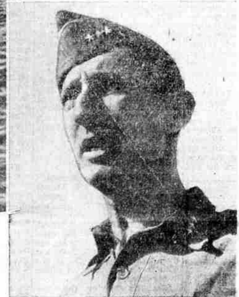
LT. GEN. MARK W. CLARK

"I HOPE YOUR BOND EFFORTS ARE SUCCESSFUL. FOR THE WAY WE ARE SHOOTING UP AMMUNITION AND USING UP EQUIPMENT, WE NEED THE FINANCIAL HELP OF EVERY SOUL AT HOME . . ." —Lt. Gen. Mark Wayne Clark