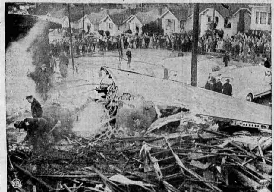
Rescue workers and firemen sift through still smoldering wreckage of Army plane in which eight crewmen perished when ship crashed into Oakland, Calif., home. Although home and plane were completely destroyed, occupants of home miraculously escaped uninjured.