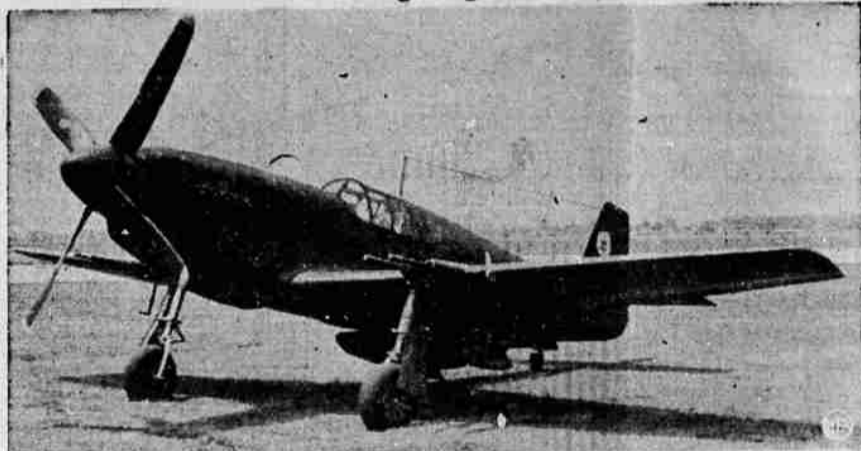
This is the new improved version of the P-51 Mustang, escort fighter which accompanied USAAF bombers on the latest long-range assault on German industry. This model has greater speed (400 mph plus), longer range and a higher ceiling well over 30,000 feet. The plane can be used as a fighter bomber capable of carrying a 1000-pound load.