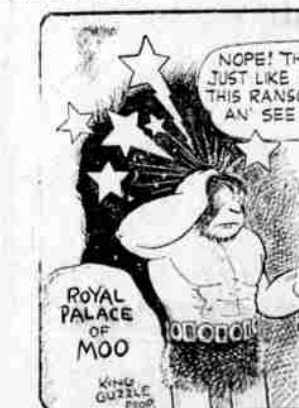
FRECKLES AND HIS FRIENDS