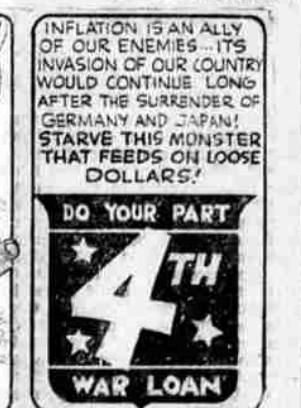
BY MERRILL BLOSSER