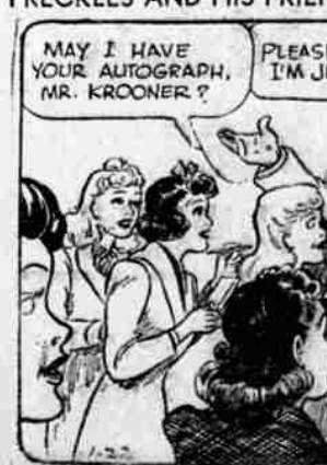
Lard's Two Cents' Worth