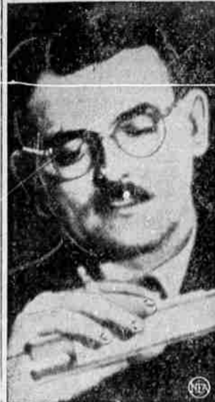
Inventor of the jet-propulsion engine that will power the new secret, rocket-type fighting plane having no propeller, is Capt. Frank Whittle, above, 36-year-old member of the RAF. The plane, said to be capable of a maximum speed of 500 miles per hour, is expected to play a major role in the knockout of the axis.