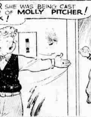
BY MERRILL BLOSSER