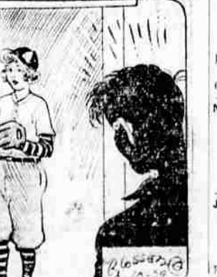
BY MERRILL BLOSSER