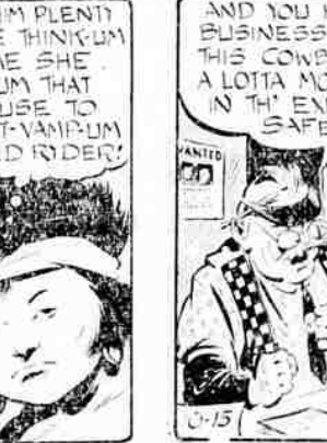
He Didn't Know the Man