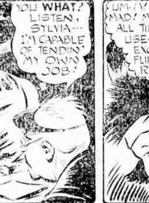
He Has Other Ideas