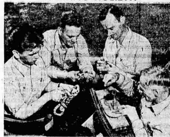
Though they've gambled with death in the performances of their duty these merchant seamen can't forget the sea, even on a holiday. Here they are recuperating at one of the many rest centers which the United Seamen's Service, a member agency of the National War Fund, maintains here and abroad, in cooperation with the War Shipping Administration.