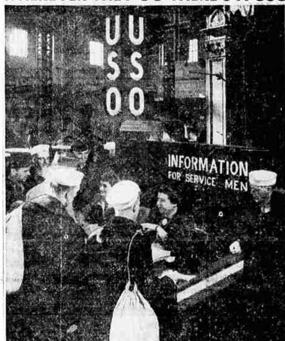
To millions of servicemen the USO is the first stop in town. Maintaining information booths in terminals throughout the country, the USO, a member agency of the National War Fund, is always ready to lend a hand to the servicemen seeking entertainment or a place to stay.

17 National Agency Members---6 State Including USO and War Prisoners Aid — Major Participants