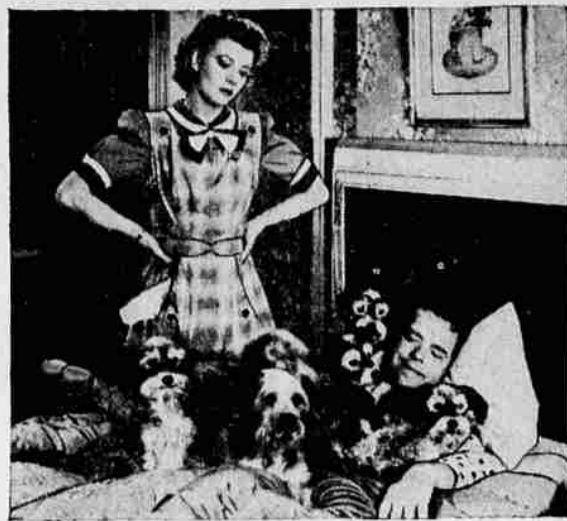
Blondie and Dadwood in their funniest role yet. See "It's a Great Life," playing today only at the Rose theatre.