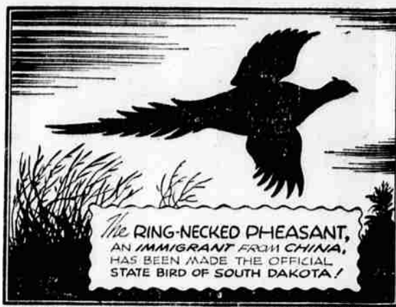
The RING-NECKED PHEASANT, AN IMMIGRANT FROM CHINA, HAS BEEN MADE THE OFFICIAL STATE BIRD OF SOUTH DAKOTA!