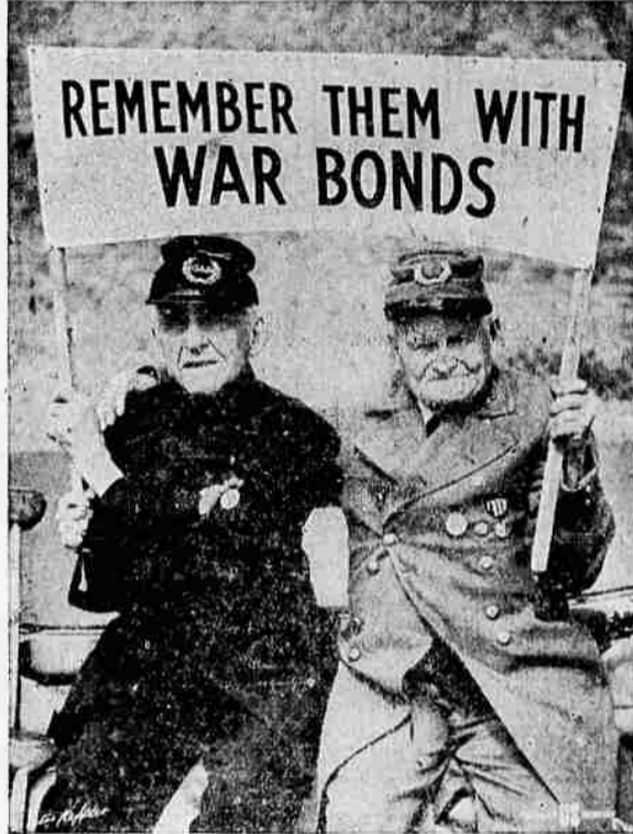
There aren't many of these grand old warriors left, but 7 million of the great-grandsons and great, great-grandsons of these men and their comrades are in fighting uniform today. They're united in a common cause—to lick the Axis.