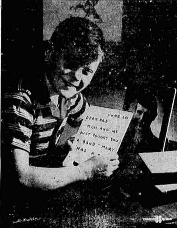
This youngster may be separated from his Dad by countless miles but today, especially, he is close to him in spirit when he writes: "June 20—Dear Dad: Mom and me just bought you a bond."