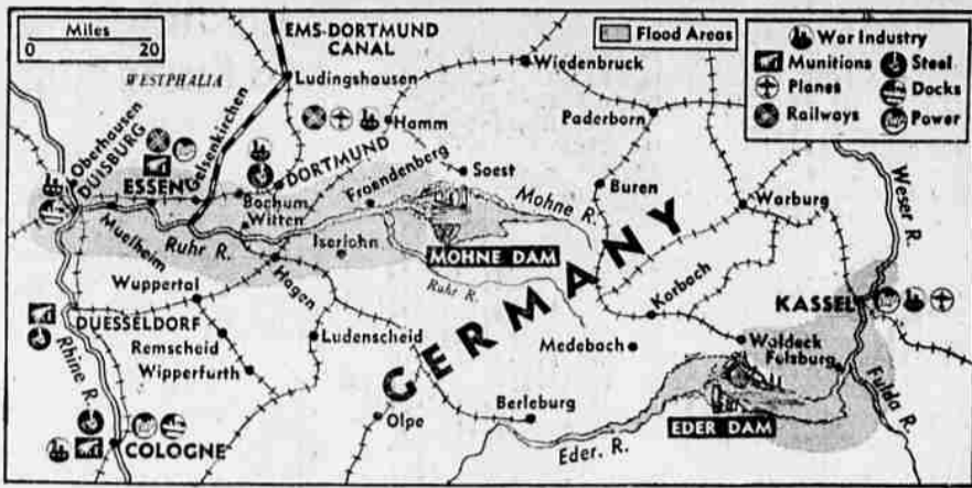
All axis Europe is taking a flood-tide pounding from allied bombers and two of western Germany's big industrial areas are flooded as the result of a dramatic RAF blast. Blasting of the Mohne and Eder dams has inundated cities and war factories, washed out railroads, bridges, docks and communications systems, and threatened use of many of Germany's canals. Map shows flooded areas.