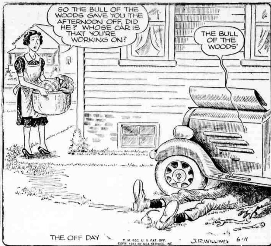
THE OFF DAY

T. M. REG. U. S. PAT. OFF. COPY 1943 BY SEA SERVICE, INC.