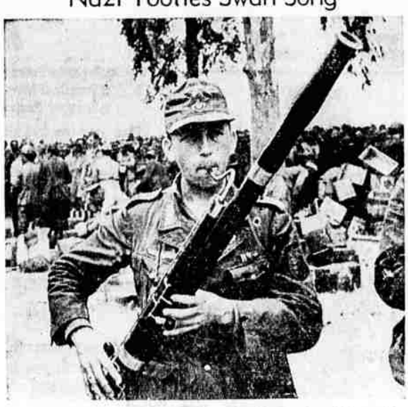
Captured in Tunisia, this member of a German band blows his bassoon in solemn screnade for war-weary comrades.