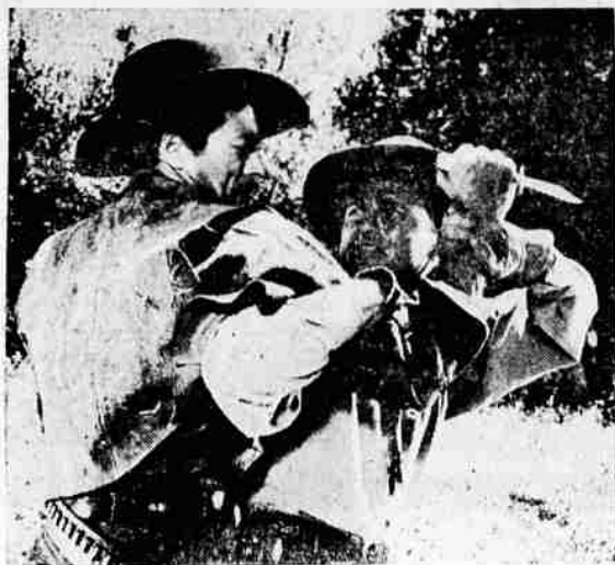
See Don "Red" Barry in Sombbrero Kid starting today at the Rose Theatre.