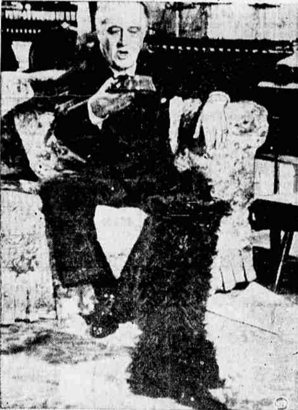
President Roosevelt takes time out from a busy day to personally feed his faithful comrade, Falla, his pet Scotty. To be sure, the pup is plenty hungry but, like all dog lovers, the President makes Falla sit up for his dish of food.