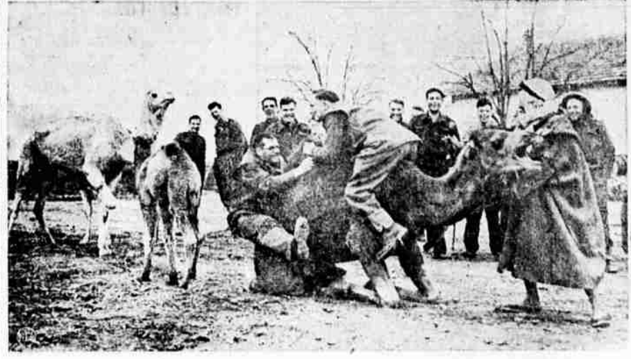
Pair of RAF flyers in Tunisia attempt to board a beast of that strange land of war, and the came seems to be getting as big a laugh out of it as snybody.