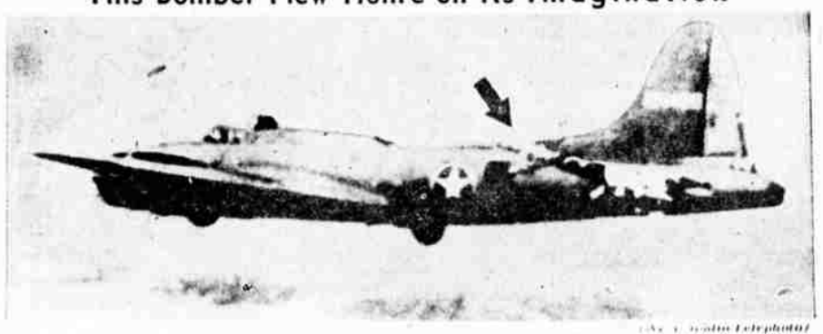
Its huge tall sheared almost completely off when nit by a German plane with a dead plane at the controls, this American Flying Fortress, piloted by Kenneth Bragg, severtheless managed to limp to its home base after completing its nombing mission over North Africa. The plane made a perfect landing but the fuselage broke in half when some one opened the door the next day.