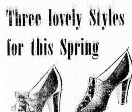
.45 Req. 4.04

SIZES I to 14. Amazing savings on dainty cotton percales! Newest Spring styles! Wonderfully well made! Tubfast!