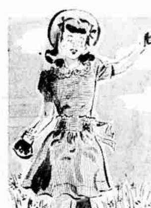
1.19 DRESSES FOR GIRLS-NOW

with colorful jackets! In all rayon or mixtures of wool and rayon. Get sayeral naw . . . and save! Sizes 24-32.