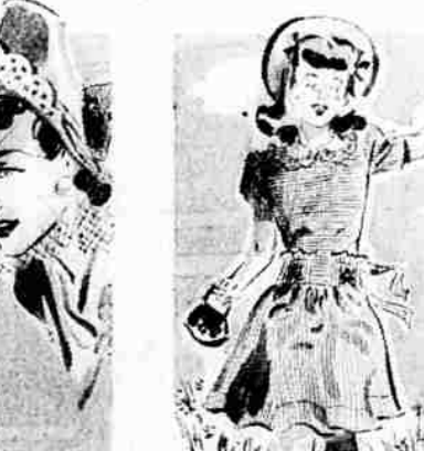
LOOK! REGULAR 1.29 HATS, NOW

Get one of each at this amazing price! Spun rayons or mixtures of wool and rayon in all the newest colors. Lots of plaids! Sizes 12 to 18.