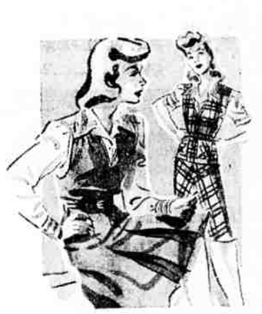
SALE! 3.98 JUMPERS AND JERKINS 3.77

2.98 Short sleeves in same fabric .... 2.77