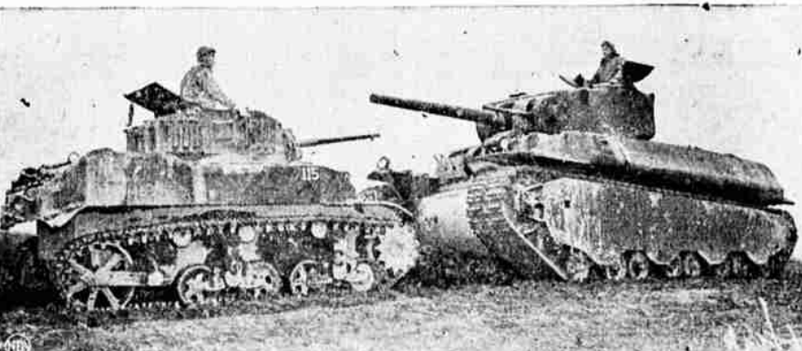
Their names are M5 and M6, but their weights are 44 tons apart. The 16-ton light tank, left, meets up with its cannon-toting big brother, the Army's new 60-ton heavy job, at Fort Knox, Ky.

Woodcraft to Meet —Lilac circle No. 49, Neighborhood of Woodcraft will meet tonight at 7:30 at the I. O. O. F. hall.